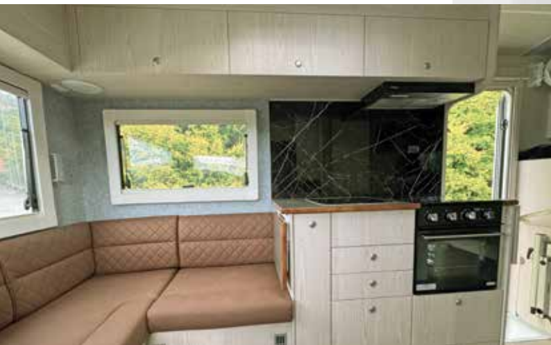
TOP: Generous space in the lounge makes the best position for surrounding views