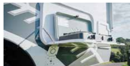
Fold-down Outdoor Table & External Gas Connection