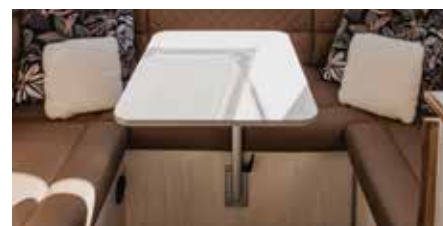
Fixed Table Leg