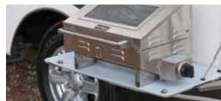
Fold down outdoor table